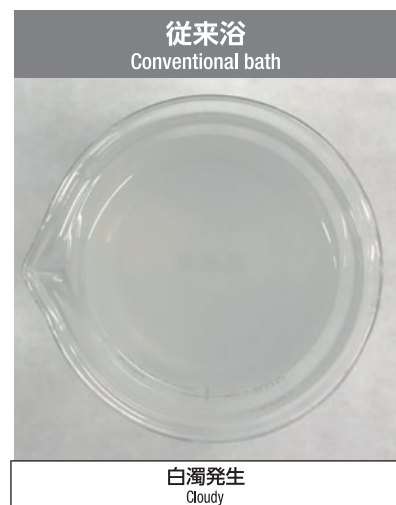
スズめっき液添加試験 Addition test of tin plating solution

※スズ濃度として同量添加 Same concentration of tin is added respectively